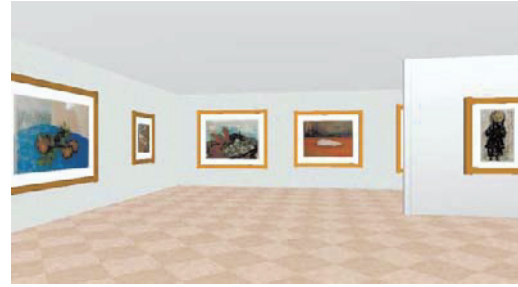
The first floor