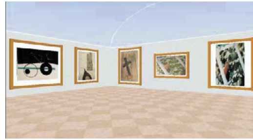
The third floor

The Gen Yamaguchi Virtual Museum is a virtual museum that the works of Gen Yamaguchi (1896-1976), a woodcut printer in Numazu-city in Japan, can be viewed through Internet from any place and at any time 1) . Because of no museum to exhibit these prints, they are kept in the Numazu City Hall, and can be viewed only few times a year. Thus, it is very worthwhile to exhibit the prints to the public through Internet. The three-storied museum is made by using the three-dimensional virtual space modeling language called VRML (Virtual Reality Modeling Language), and the visitors can freely “walk through” each floor. The prints were photographed by digital camera, and pasted as texture images. The explanations of a woodcut print can be shown by clicking the image.